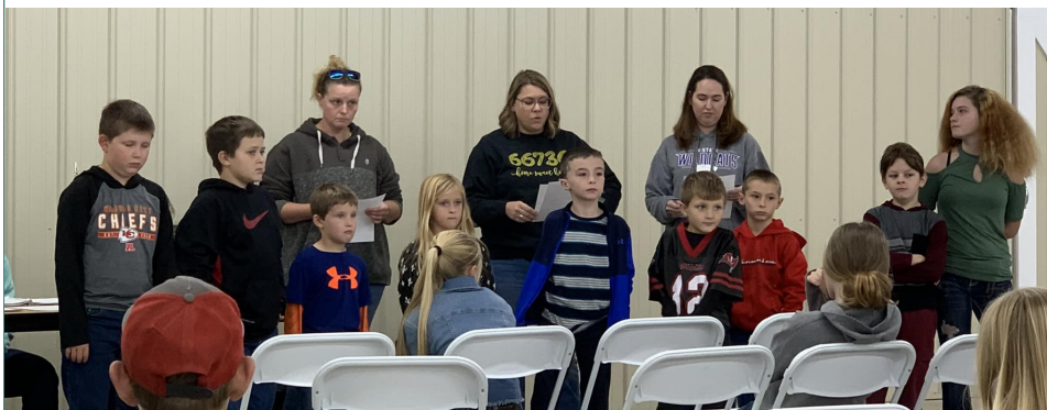
Wilson County 4-H has welcomed many new members this year, pictured here The Busy Beavers 4-H club welcomed 10 new members this year at a recent meeting.