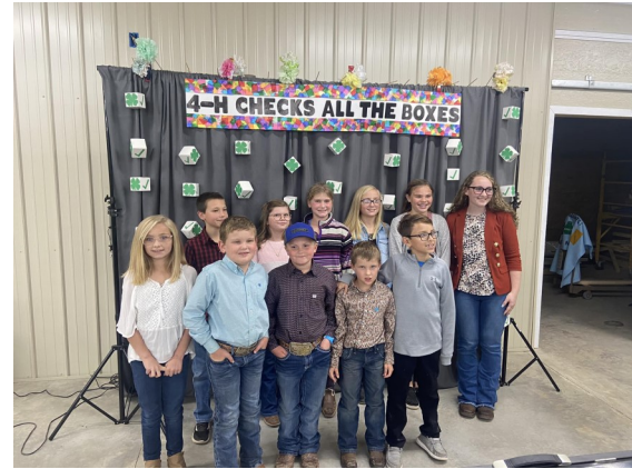
Busy Beavers 4-H club at the awards banquet, after winning county project.