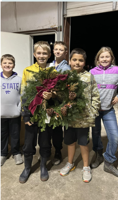
Lucky Horseshoe Club members promoting their Christmas greenery fundraiser.